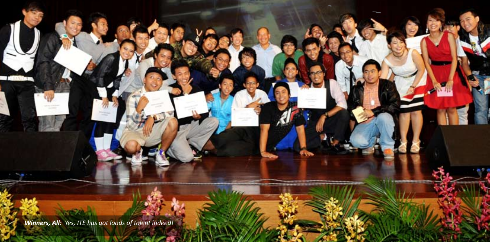
Winners, All: Yes, ITE has got loads of talent indeed!

A FTER what seemed like endless rounds of auditions and screenings, iTalent 2010 – ITE's inaugural search for performing talents among its students – culminated in an exciting Grand Finals held at ITE College East on 15 March 2010.