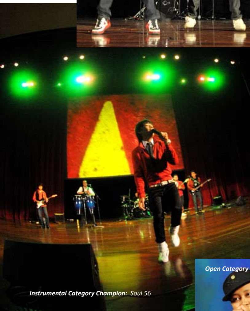
Instrumental Category Champion: Soul 56

iTalent 2010 was indeed a super-duper success and it promises to return with a new batch of hopefuls next season!