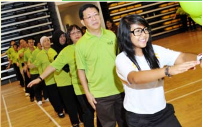
Do What I Just Did: Following a sequence of movements from the person in front, participants had fun in the Algorithm March.