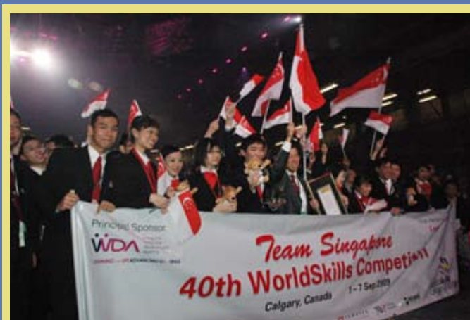
The Best in Skills: Team Singapore celebrating its best-ever showing at the 40th WorldSkills Competition held in Calgary, Canada, in 2009.

For more information, please visit www.ite.edu.sg/wss .