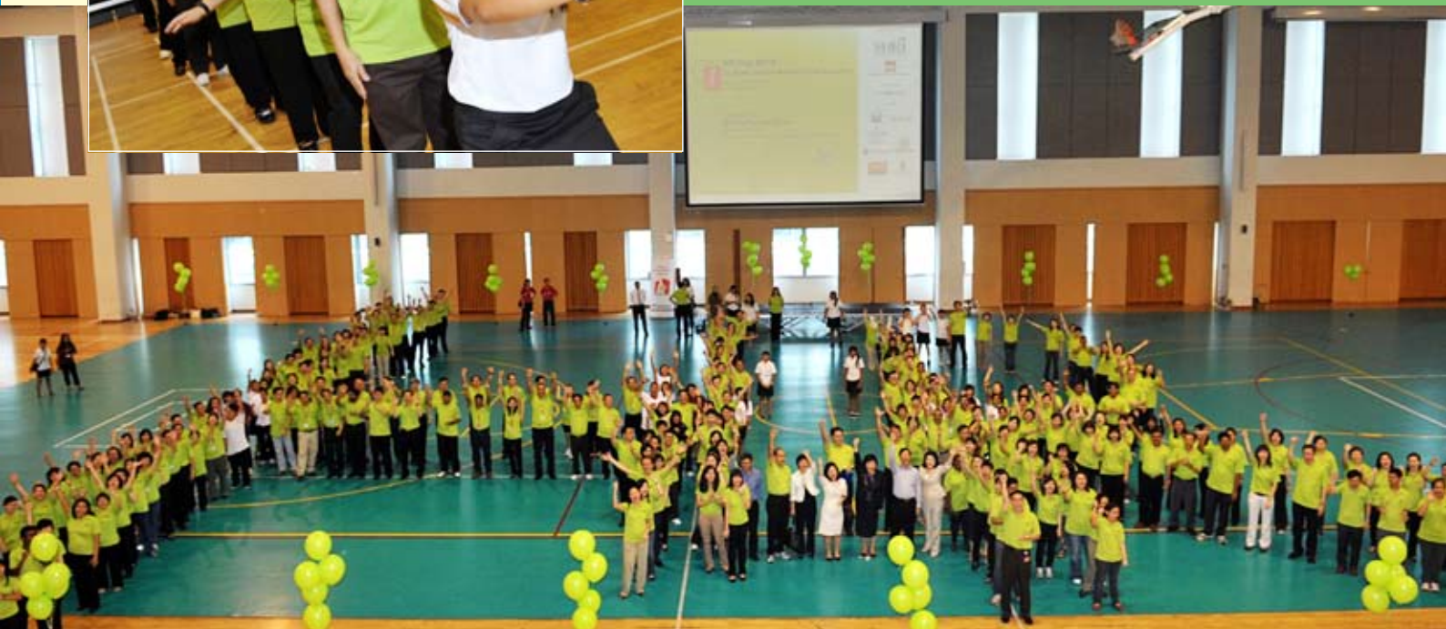
Go Green: A big green “HR” was formed after the record-setting Algorithm March.